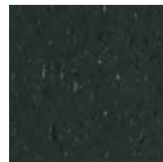
AL256 Starry Night