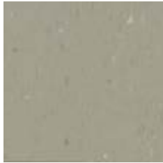
AL166 Smoky Taupe