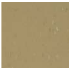
AL186 Light Camel