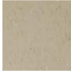
AL126 White Sand